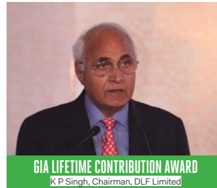
GIA LIFETIME CONTRIBUTION AWARD K P Singh, Chairman, DLF Limited