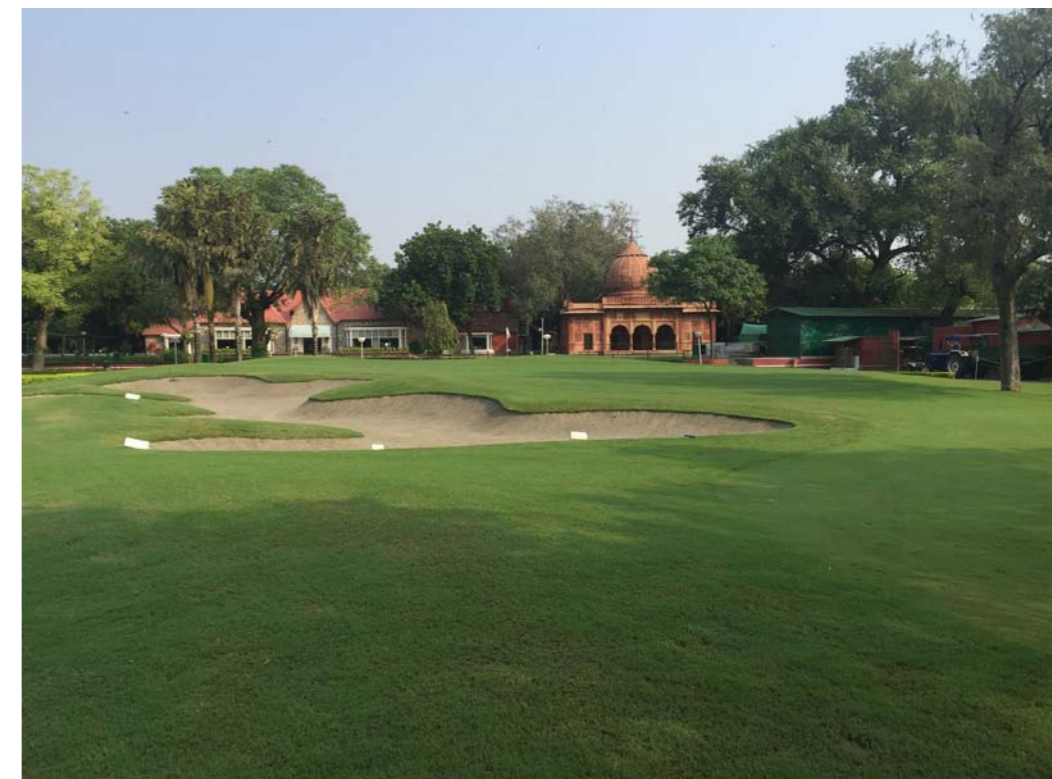
Rainbird Irrigation used on the newly redeveloped Peacock Nine at the Delhi Golf Club

It will do a much better job because a professionally designed system will deliver exactly the right amount of water to individual turf areas of the golf course. A manual system relies on individuals who may or may not be trained turf professionals and will likely give too much water or not enough. A single professional can operate a fully automatic system and deliver the most economical water amounts at the correct time.