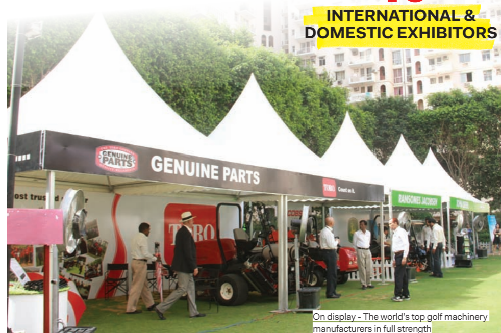
On display - The world's top golf machinery manufacturers in full strength